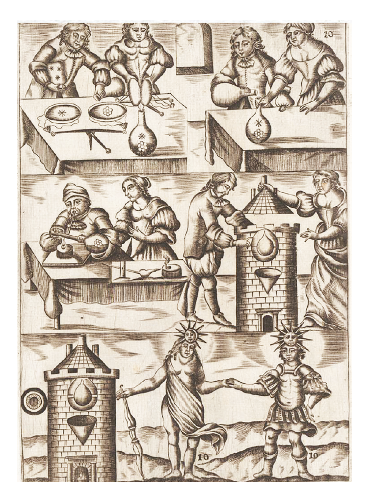
Alchemists at work, from Mutus Liber, a 'Mute Book' of illustrated plates (with no written text), 1677.

<sup>2</sup> Getty Research Institute 2017