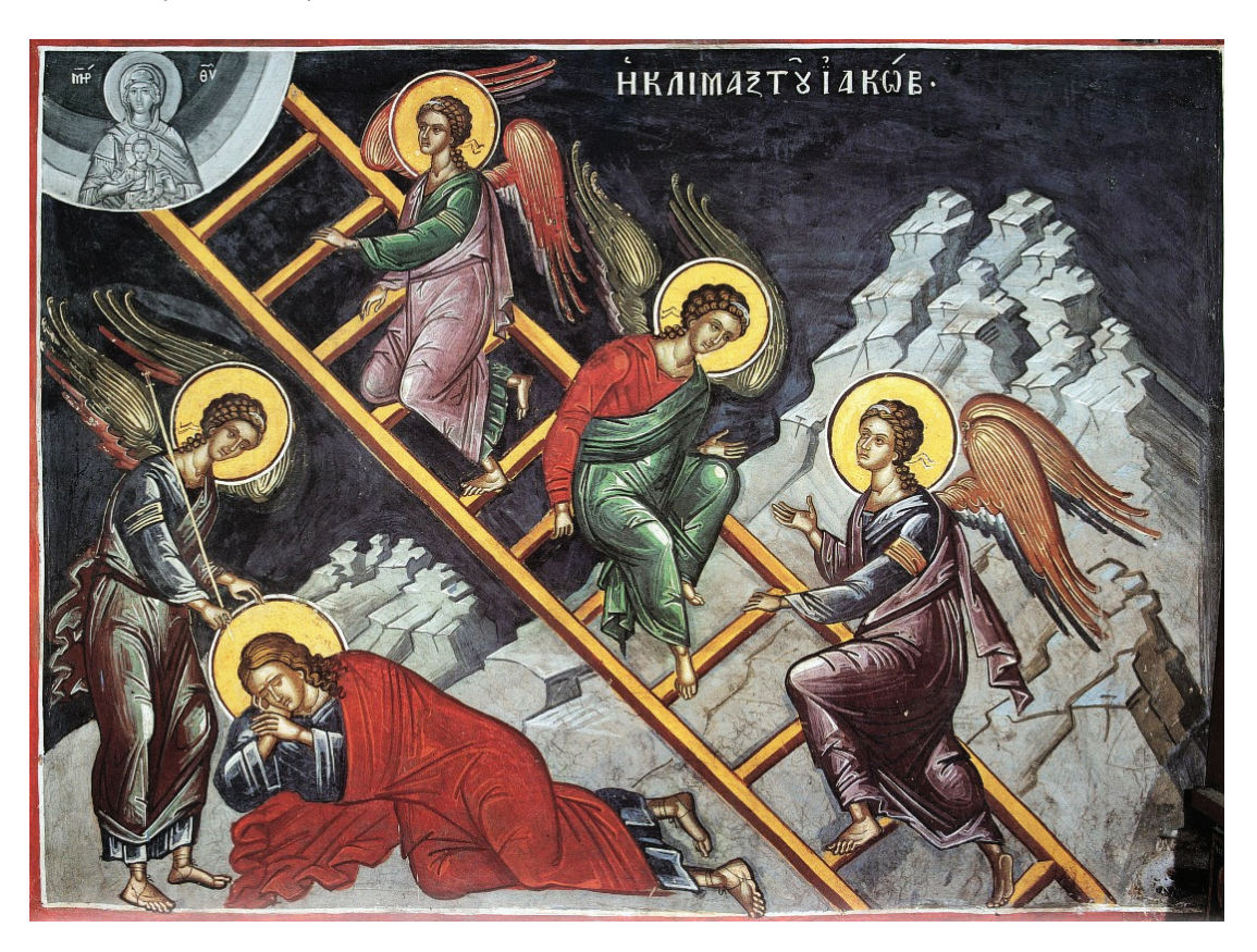
A 16th-century Greek fresco depicting the Old Testament dream story of Jacob's Ladder at the Dionysiou Monastery on Mount Athos. 79

The theme of Déjà Vu reached out for the capricious—that strange sense of a return or re-experience, and that paradoxical feeling that some place or thing is eerily familiar and half-remembered, yet finally elusive, ungraspable. I recall the final exhibition encapsulated exquisitely these complexities around the palpable but indescribable. When we're struck by déjà vu, it's a kind of revelation: a startling flashback to remind us of the centrality of time to human experience. Déjà vu excites an out-ofbody experience: a potent and important reminder of where we've come from, who we were, and who we are now.