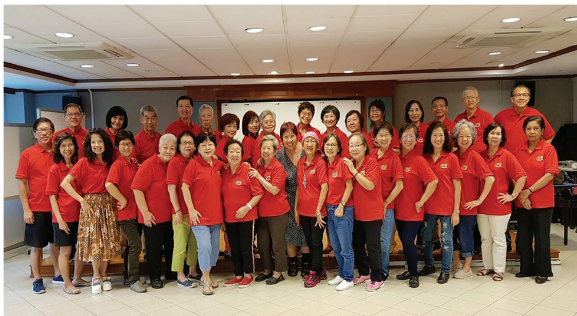
Fig. 1 Members of The Glowers Drama Group, 2018.