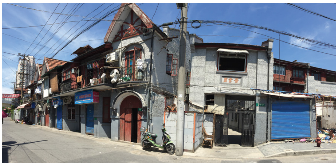
Facing Donghengbang Road, the main gate of Jingyun Li bears three Chinese characters reading from right to left. The street of Donghengbang Road has always been home to a street market.

At the end of the conversation, she added that she also wondered why she had never been approached by a decent government officer but only men wearing colourful shorts and slippers, who were in fact employed by the government real-estate company to do the job. Why, after all, did she have to return her place of residence to the government for an unknown cultural purpose? Why could she as an individual not contribute to the cultural character by continuing to live there? Above all, the proposed compensation from the government was far below market value of this house and she could not afford to obtain a similar house here with the compensation.