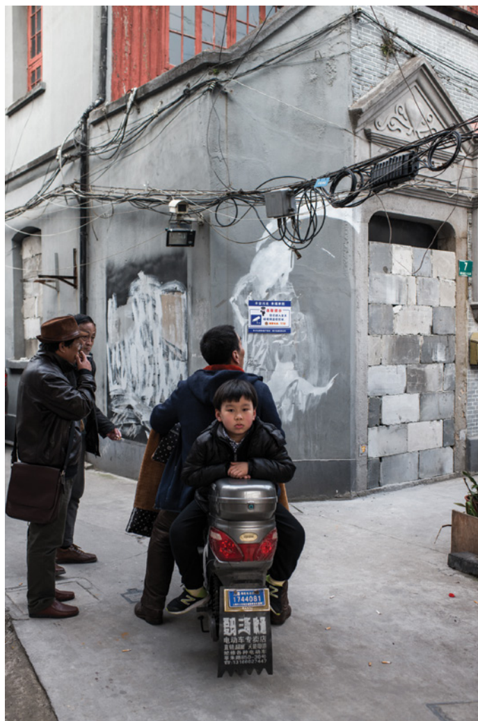
March 2018.

One day in March 2018, when Ms. Cheng left home to visit Japan, her tenant was forcibly evicted by a mob. All their belongings were removed from the house and the door openings were sealed up with hollow bricks which were light and easy to pile up to form a 'wall'. Strangely, after one year of rain and heat, the original spray-painted woodcut image at the south facade looked clearer than the year before. What had been washed away was the white paint that had been applied roughly to cover and censor the woodcut print image. What had been added over the 'hidden eye' of this image was a police notice.