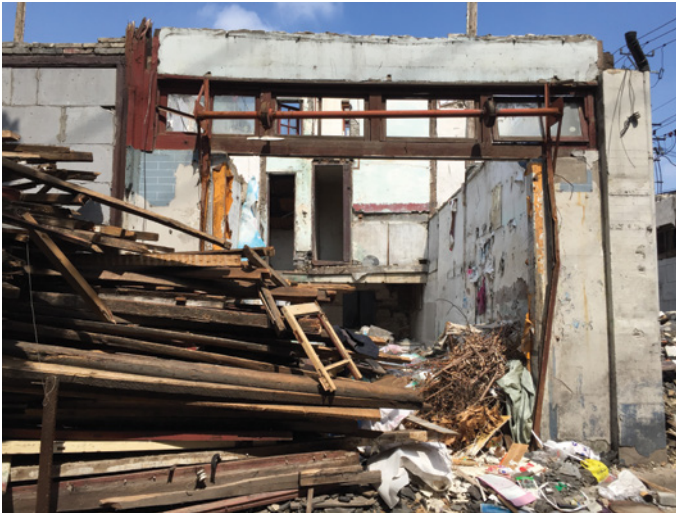
The demolished neighbourhood near Jingyun Li.