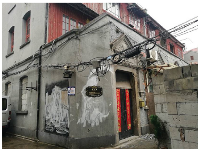
10 February 2019.

time, the neighbourhood which once served as both a living space and a protection for those left-wing progressive writers is almost flattened. The backstreet of Duolun Road is left in ruin and the only houses that still stood there were in Jingyun Li. Only cultural celebrities and their legacies remained but were left placeless, and out of place.