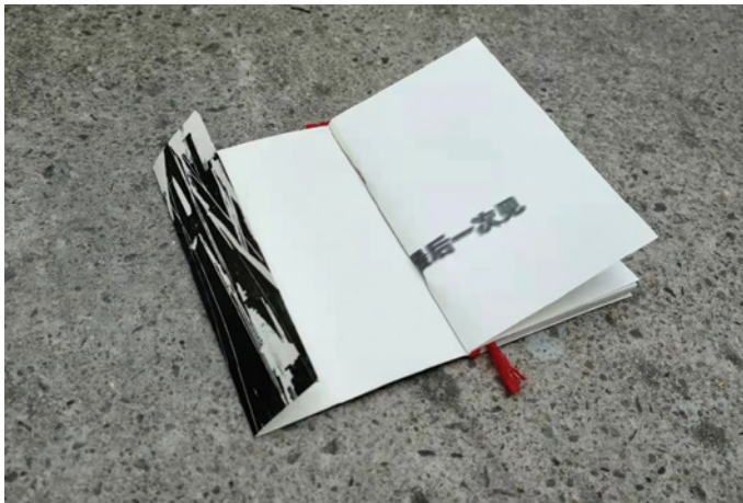
The publication of 51 Personae, The Last Time I Saw.