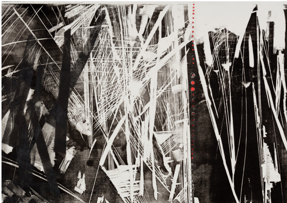
Artist anonymous, Wild Grass , woodcut print, 2019.