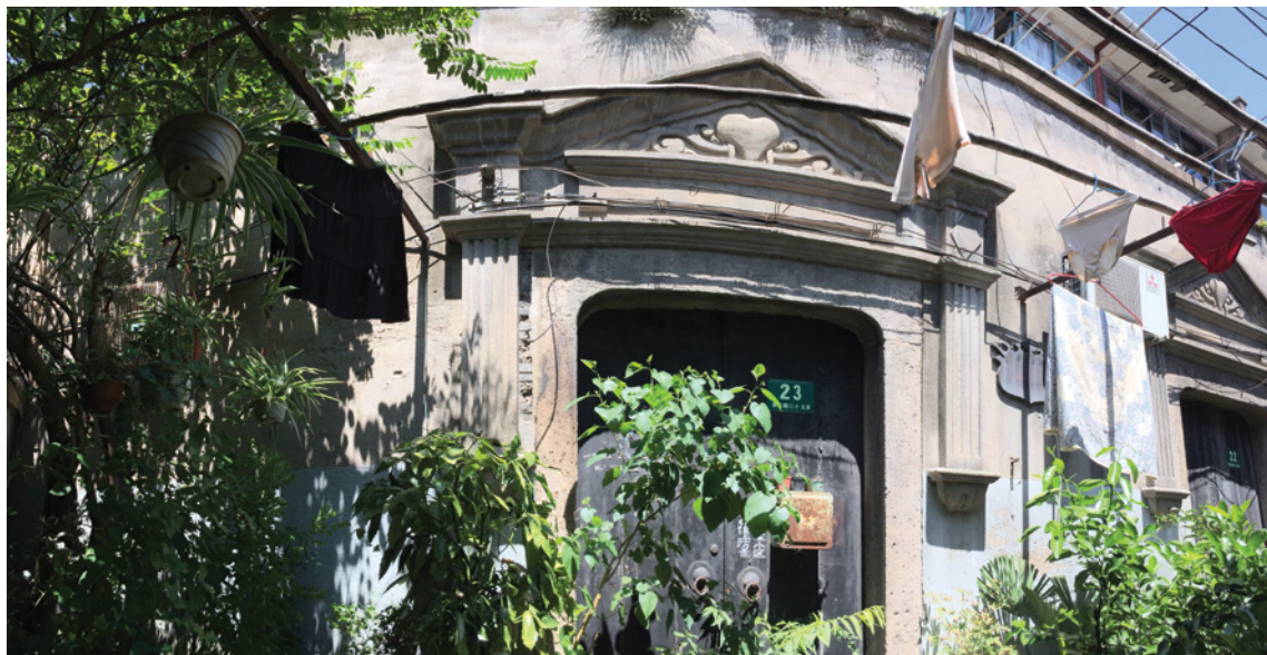
The gate of former Lu Xun's residence, No. 23 Jingyun Li.

With the gentrification of the city, and the demolishing of the old neighbourhoods, street markets are disappearing. After Duolun Road became Street of Cultural Celebrities, a grand gate was set up at the back door of Jingyun Li which the residents never use.