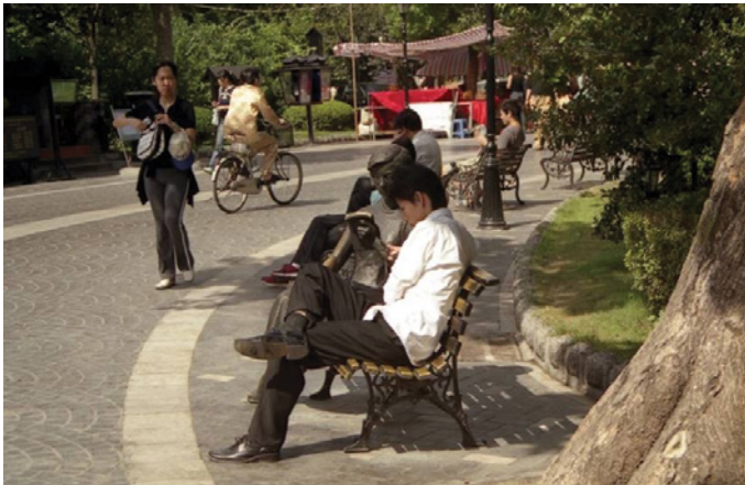
The L-turn street corner of Duolun Road.

Emergencies in an urban setting like Shanghai, with a population of 250 million, bear all the above features.