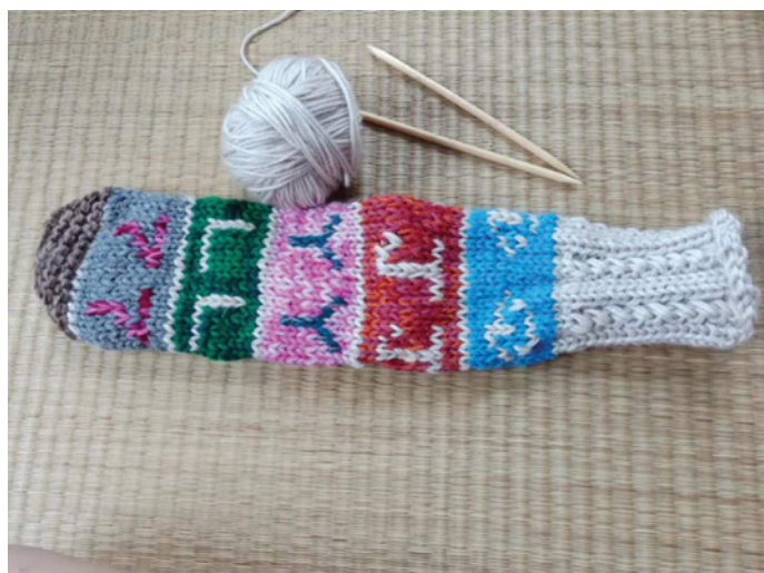
Jingyun Li 7 series fleece socks. Knit by Cheng Shaochan, of various random colours with leftover yarn. Size varies.