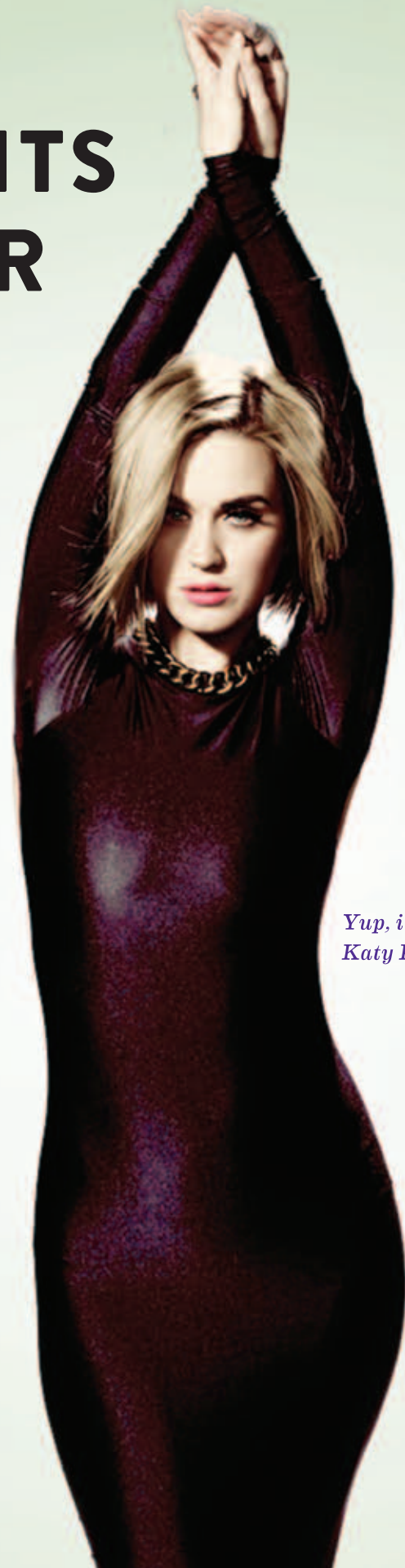
Yup, it's Katy Perry

NEW SEASON DEBUT STARTING 5 OCTOBER CATCH YOUR FAVOURITE HOLLYWOOD STARS EVERY SATURDAY 10PM