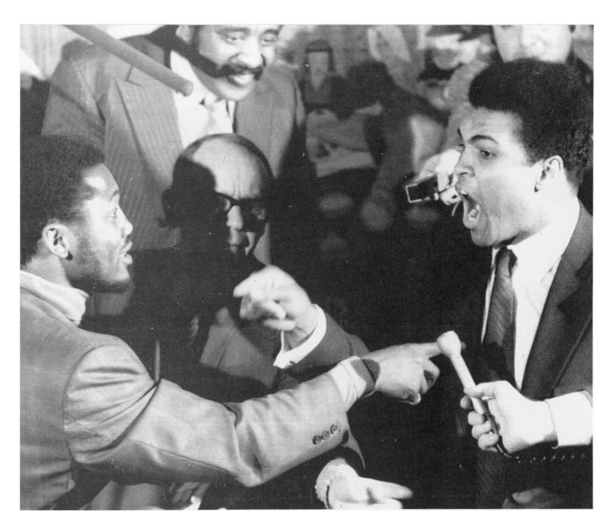
Ali, the Fighter: Joe Frazier (left) and Muhammad Ali do battle at a pre-fight press conference

sition to the Vietnam War.) Greaves deftly interweaves exchanges between fighters and their fans with scenes of press conferences, training sessions, and business discussions—then ends with the fight itself. The film's behind-the-scenes images often pertain to the economic politics—and more implicitly the racial politics—involved in the promotion of the fight. While Ali, the Fighter received national distribution in commercial theaters, Greaves was not so fortunate with Nationtime: Gary, his film of the historic first National Black Political Convention in Gary, Indiana. Attended by about 10,000 people, this 1972 gathering included representatives from the full range of African-American culture and politics, from Amiri Baraka (LeRoi Jones) to Jesse Jackson and Coretta Scott King. The film covers the efforts of participants to create a platform acceptable to the numerous constituencies within the black community. Jackson steals the show with a rousing and uncompromising speech calling for black political unity in the face of white-dominated party politics. The subject matter was considered too militant by commercial broadcasters, and the film never aired.