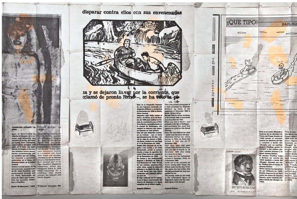
To Return (YVR) Airmail Painting No. 102 1993 paint, stitching, charcoal and photosilkscreen on six sections of non woven fabric 165¼ x 165¼ in/420 x 420 cm