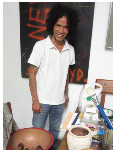
S. Teddy, 2012

get better with age. A few years ago I started to photograph artists when I first met them and ask them to take a photograph of me. But I normally forget to do it. When you first meet people you are too focused on what they say, their body language.)