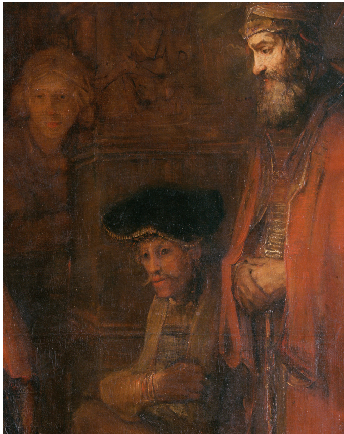
Rembrandt. The Return of the Prodigal Son , detail, 1669.

And in the right place. The journey to see something is part of the