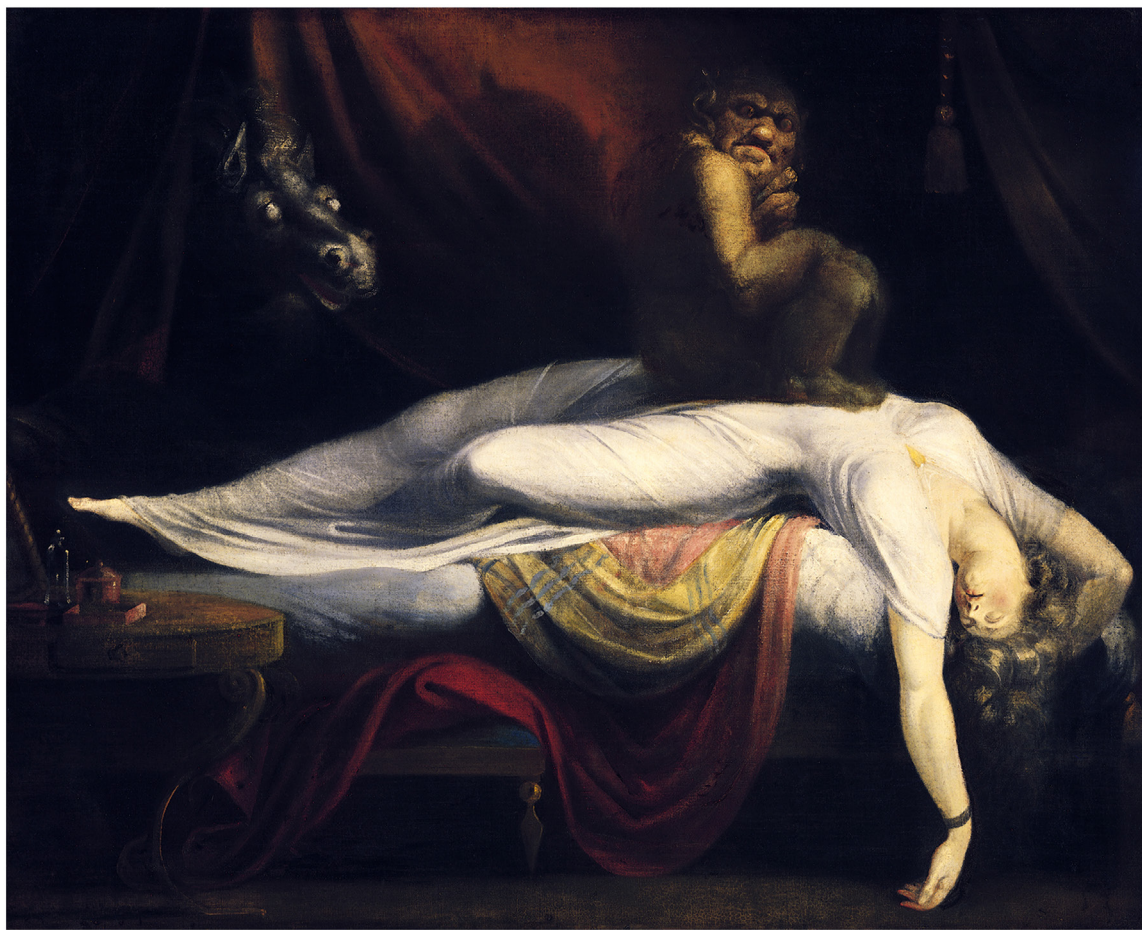
Figure 1. Henry Fuseli, The Nightmare , 1782