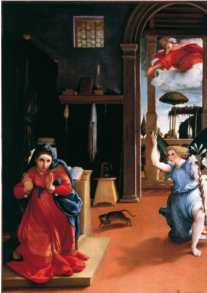
Lorenzo Lotto. Annunciation , 1534

Rothko is the name that would often bubble up in this discussion now.