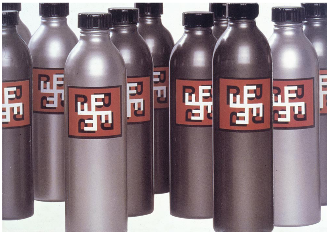
Babyface fictional cosmetics company, Eve Anne O'Regan, 2000.