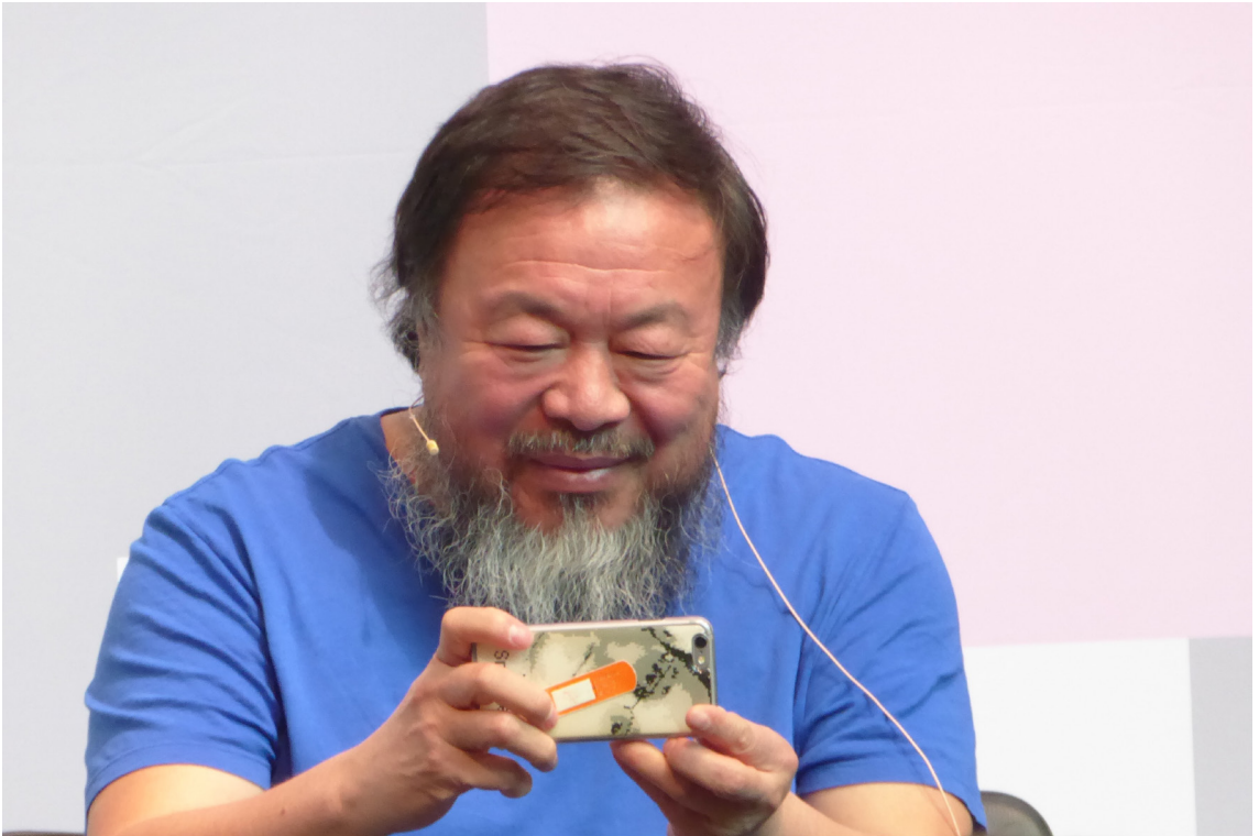
Ai Weiwei at media conference National Gallery of Victoria, Australia, November 2015.