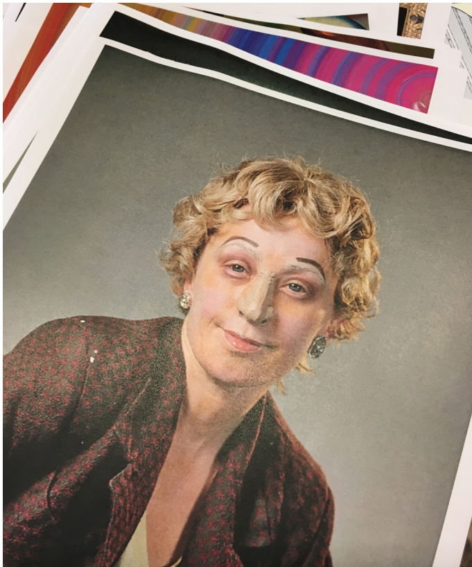
Cindy Sherman, photo taken in Queensland Art Gallery Press Office, Australia, by Peter Hill, April 2016.