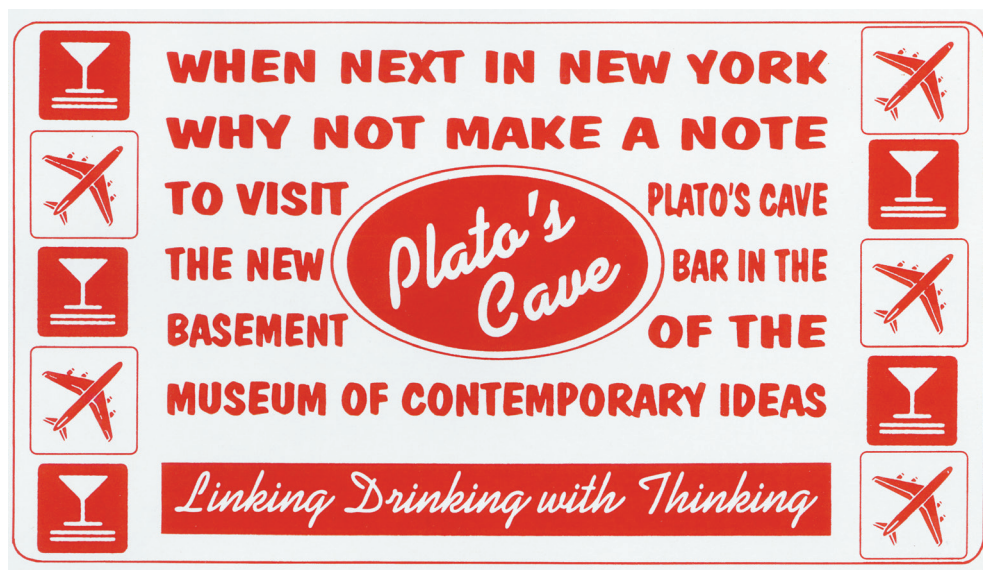
Plato's Cave: Linking Drinking With Thinking, the bar in the basement of The Museum of Contemporary Ideas (1989 – continuing).

In 2006, Amanda Heng created a fictitious travel agency that promoted a tour of four Chinese-Singaporean cultural collections that were notionally re-sited in the region, outside Singapore. The artwork, Worthy Tour Co (S) Pte Ltd , was first shown at the inaugural Singapore Biennale (City Hall building). This artwork has been recreated within the new National Gallery Singapore, halfway up the wide internal flight of stone stairs. According to the wall text: "These collections reveal the cultural intersections between Singapore and the rest of Asia, and also considers the place of these cultural materials within museology." There are interesting parallels between this project and Urich Lau's The End of Art Report (2013) exhibited at the 2013 Singapore Biennial