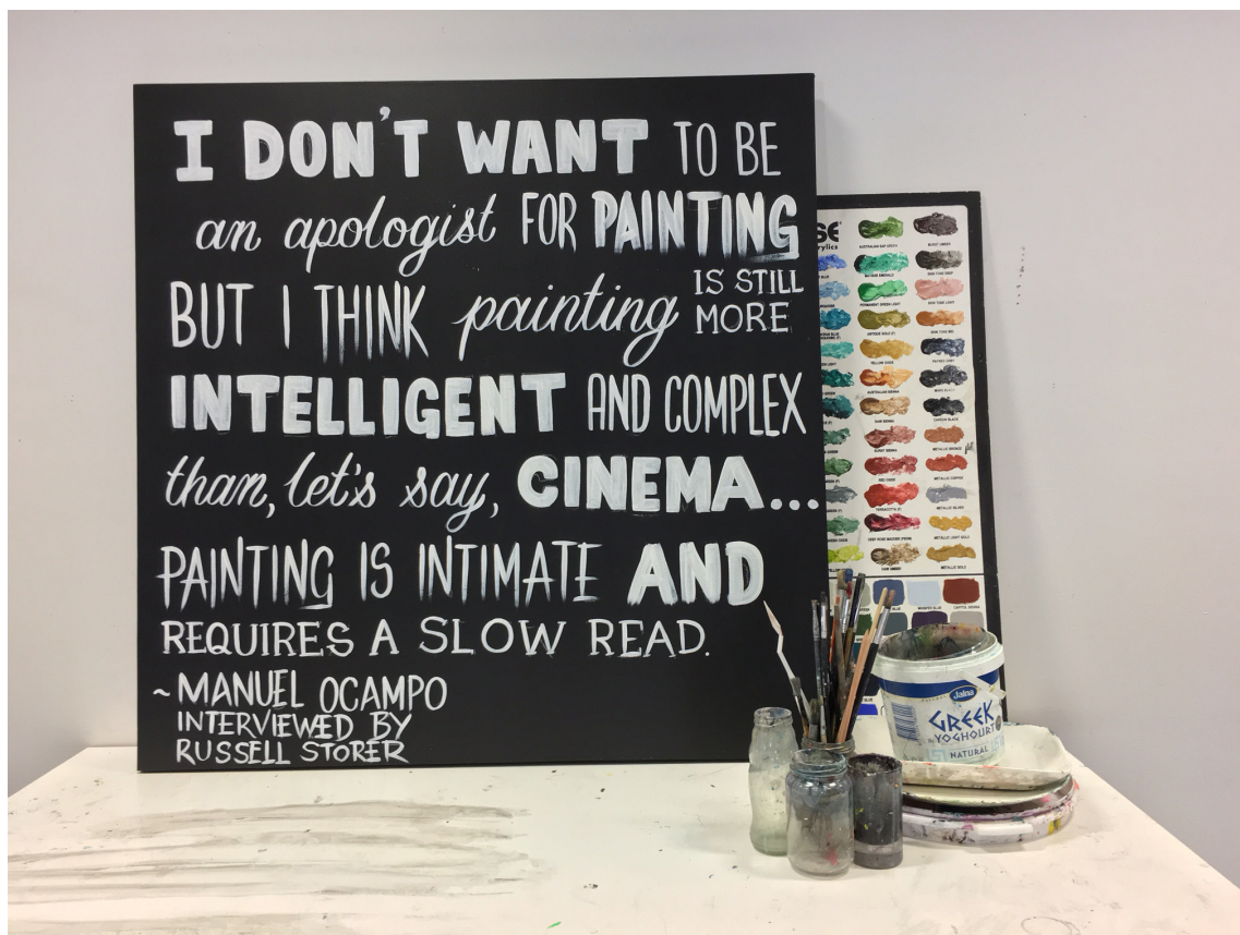
Paintforum International: Making Superfictions Real , by Peter Hill, Blindside Gallery, Melbourne, Australia (2015). © Peter Hill.

Peter Hill: General Idea is a fictional construct that finds its subversive outlets across a range of media including film, performance, installation, video and photography. It is 24 years since the three of you invented it. How close have you remained to your original vision?