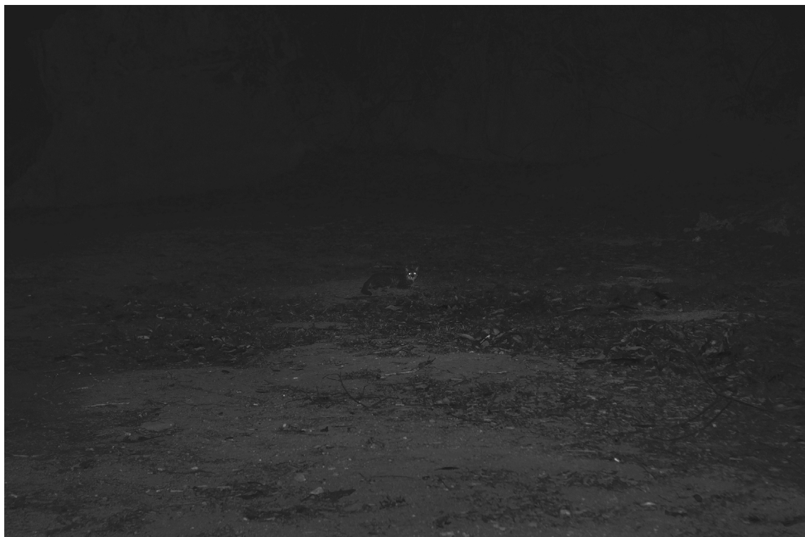
Robert Zhao Renhui Last Cat On Christmas Island , 2016 60cm x 40cm, Diasac, 2016 www.landarchive.org www.criticalzoologists.org

dealing seriously, and at times humorously, with the fragile ecologies of our planet. In the 2013 Singapore Biennale, he exhibited A Guide to the Flora and Fauna of the World , described in the catalogue as: “an installation which seeks to document and reflect on the myriad ways in which human action and intervention are slowly altering the natural world. Based on the evolutionary premise that all living things constantly change and adapt to cope with and respond to their changing environments (or risk extinction), Zhao’s Guide presents a catalogue of curious creatures and life-forms that have evolved in often unexpected ways to cope with the stresses and pressures of a changed world. Other organisms documented in the installation are the results of human intervention – mutations engineered to serve various interests and purposes ranging from scientific research to the desire for ornamentation. Several specimens in this installation are based on fact; others are works of fiction. The line between the two is often an indistinct one, as scientific advances in the last half-century have made possible what was previously believed to be impossible.”