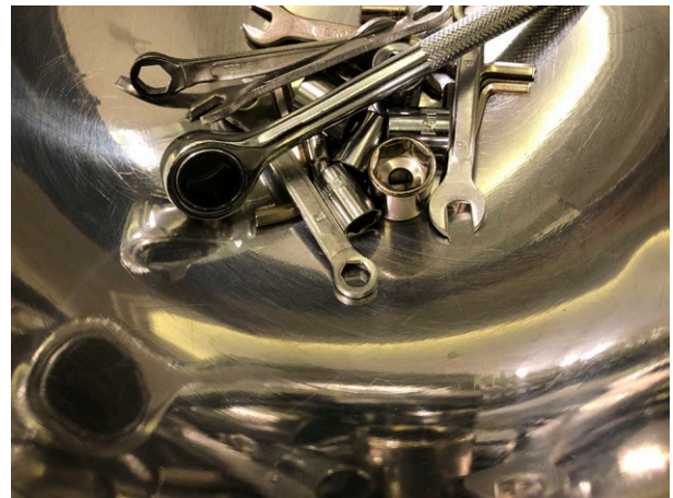
Figure 3. Ronald P.M.H. Lay, Working mechanics of reflection(s) , 2020, mixed media, dimensions variable.

how privilege and difference are manifested. With this ever present in my mind, and in the context of where I currently reside and work, I was compelled to create an image and to contribute this to Victoria's project (Figure 3). Conscious of the need to remain sensitive here, my description remains surface-level. Nonetheless, I must state my gratitude to the migrant workers who have contributed much to this country